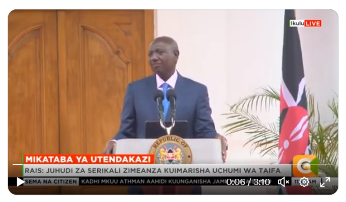
4:58 PM · Aug 1, 2023 · 519.3K Views

How do you run a department if you don't have knowledge? That is the highest level of incompetence.