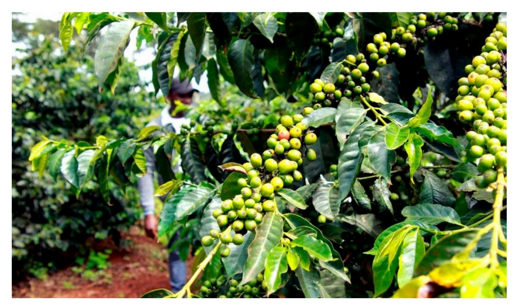
A farmer tends to a coffee bush in Nyeri town on May 10, 2023. Coffee, macadamia, rice, tea and avocado have recorded a drastic drop in prices in recent months as powerful cartels invade the agriculture sector, threatening the livelihoods of thousands of farmers nationwide.