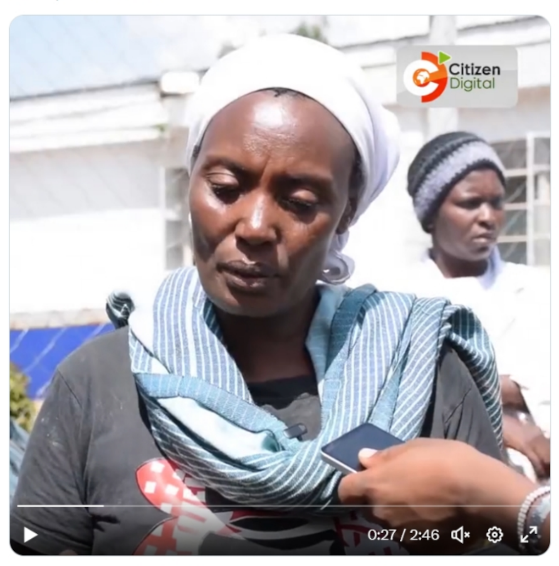
2:58 PM · Aug 16, 2023 · 169.3K Views

Two dead, seven hospitalised after consuming maize flour they picked at a dumpsite in Thika